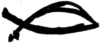
Fish - The oldest known symbol representing Christ