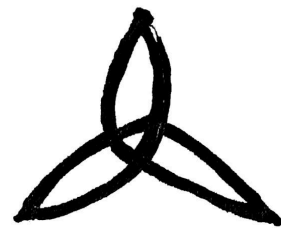
Trefoil — Three overlapping shapes in one seamless form symbolizing the Trinity