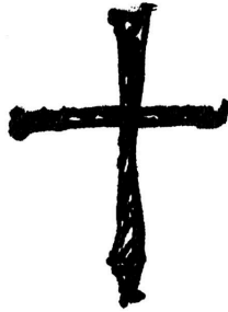
Cross - The symbol of Christ's victory over sin and death.