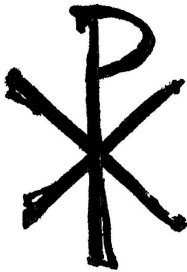
Chi-Rho — Ancient monogram using the first two Greek letters of "Christos"