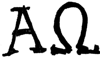
Alpha and Omega - Jesus stands at the beginning and the end of all things